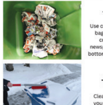
Use compostable bags or place crumpled newspaper at the bottom of the cart.